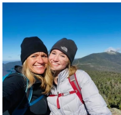
MUMC Crop Walkers