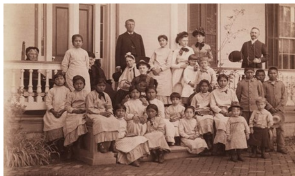
Phot of Capt.Pratt and students at the Carlisle Industrial School. Pratt served as head of the Carlisle school where Native Americans were sent. Photo circa 1900, courtesy of Yale Collection of Western Americana.

The bill can be viewed at https://www.congress.gov/bill/116th-congress/house-bill/8420/text