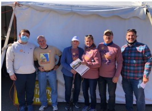
MUMC Crop Walkers