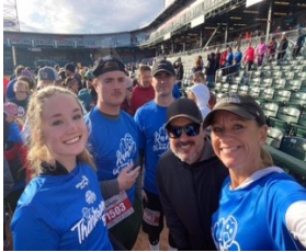
Our 5 K Runners